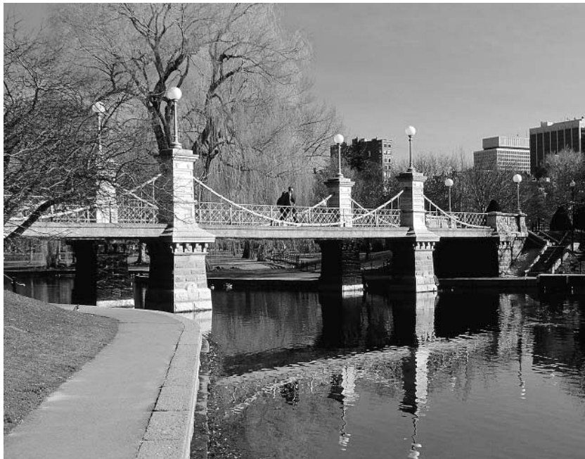
Bridge over the lake on the Boston Common (p77)

Bostonians have the great fortune to witness the greening of their city, quite literally. The Central Artery is underground, out of sight, soon to be replaced by the Rose Kennedy Greenway (boxed text, opposite). The new park will provide a pleasant counterpart to the Charles River Esplanade (p198), on the south shore of the river, and the Emerald Necklace (boxed text, p104), stretching from the Boston Common to Franklin Park. And certainly after 15 years of construction, the greenway is a welcome addition to an otherwise concrete landscape.