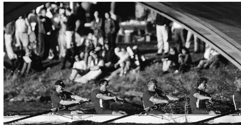
Head of the Charles Regatta (p16)

Boston's best month. The academic year is rolling; the weather is crisp and cool; and the trees take on shades of red, gold